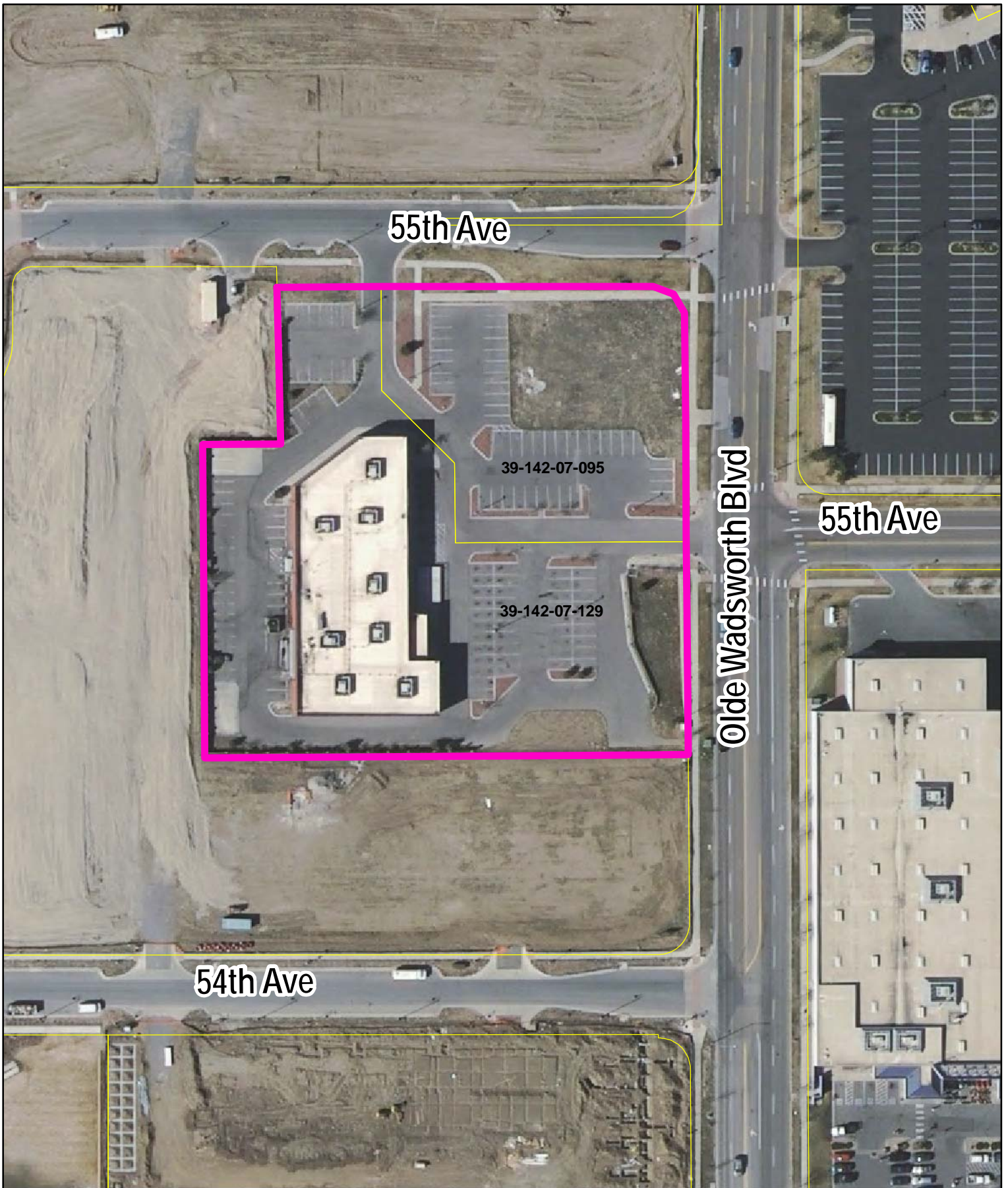
Exhibit 2-1: Village Commons Study Area Boundary