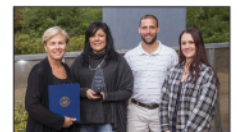
Natural Grocers by Vitamin Cottage – Arvada staff

Boulevard. Natural Grocers is being recognized for its $750,000 in capital investment in façade of the entire center located at 77th and Wadsworth which included significant interior improvements to open up an interior walkway to all tenants.