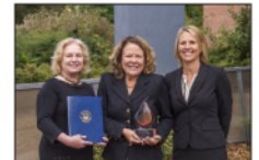
Community First Foundation

Bypass. Community First Foundation is being recognized for their assistance to donors and nonprofits which enables them to come together to