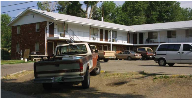
Old apartments in the vicinity of the Olde Town Water Tower.