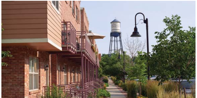
Water Tower Village.