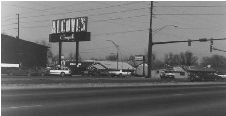
Circa 1970, near I-70 and Wadsworth.